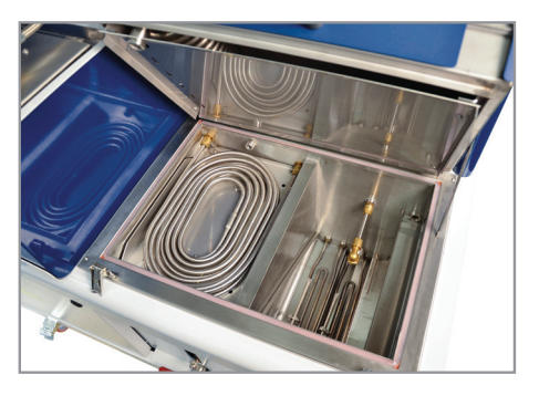
100% stainless steel distillation chamber. Easy to clean.