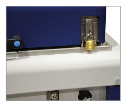
Safety locks to protect against accidental opening.