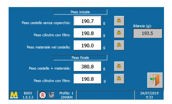
Automatic asphalt content calculation at the end of the test. Test results export to a .txt file to create customized reports.