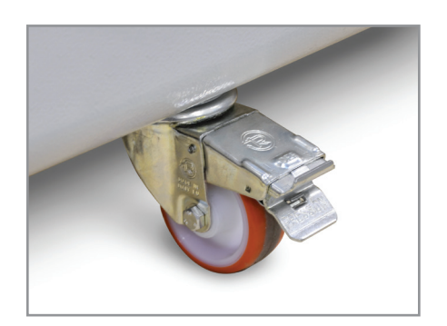
Integrated 4 wheels for easier placement and movement in the lab.