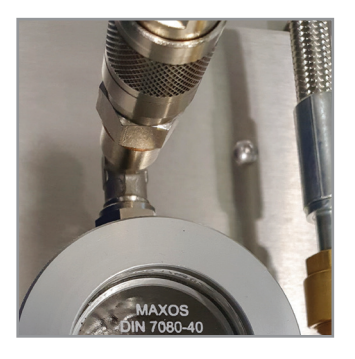
Fully automatic cycle with electro-valve.